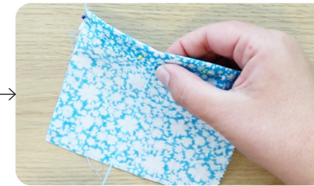
Use a needle and thread to sew running stitches along the hem.