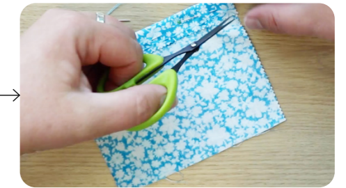
Tie a knot at the end of the hem and cut the thread. Iron along the crease to flatten the hem.