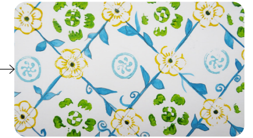
Repeat with other blocks and colours until the pattern is complete.