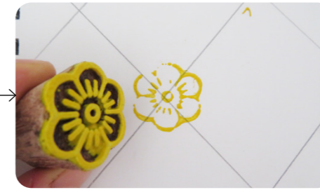
Press the block onto a piece of paper or fabric.