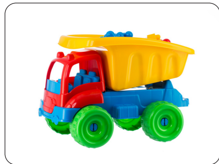
This toy is made from plastic.