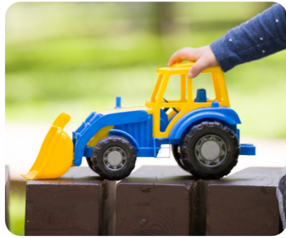
A plastic toy is hard and smooth.