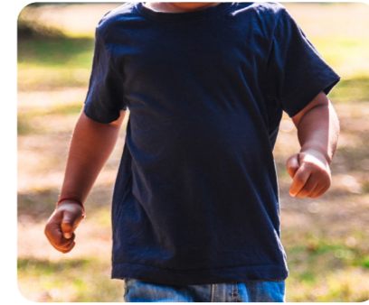
A cotton T-shirt is soft and stretchy.