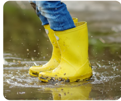
Rubber wellies are waterproof and bendy.