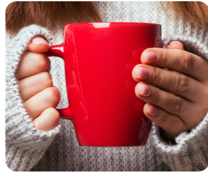
A ceramic mug is hard and waterproof.