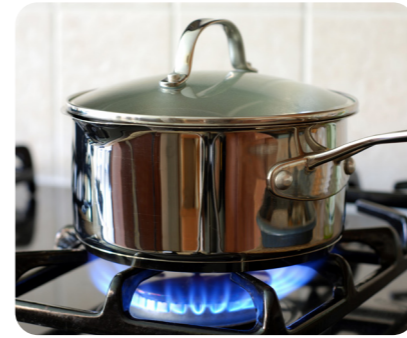
A metal pan is smooth and shiny.