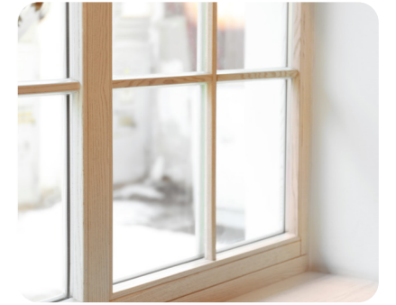
A glass window is hard and transparent.