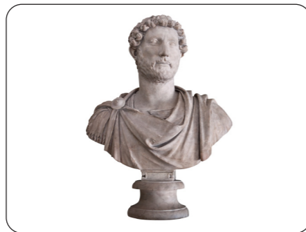
This statue is made from stone.