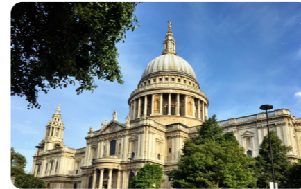
St Paul's Cathedral