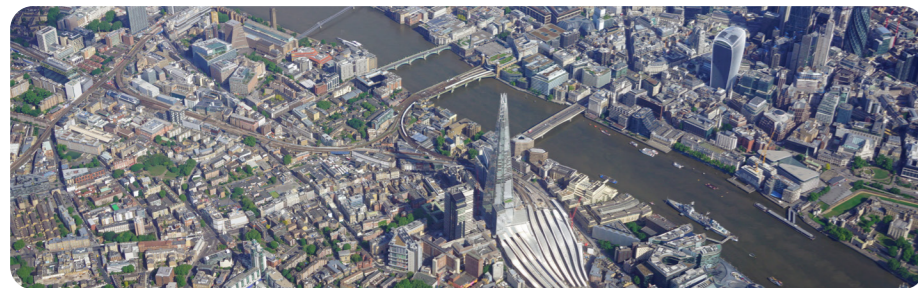
Aerial view of London

A city is a large, busy settlement where lots of people live and work. A city usually has a cathedral, a river, important buildings and offices where people work. There are lots of things to see and do in a city. There are many shops and restaurants to visit.