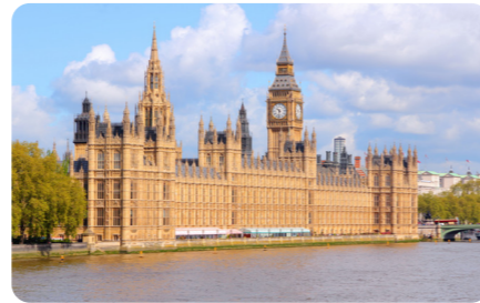
Houses of Parliament

London is a city. It is the largest settlement in the United Kingdom. Over eight million people live there. The River Thames is the main river that runs through the city. Tourists visit London to shop and see its famous landmarks.