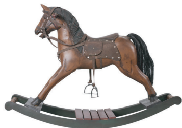
wooden rocking horse