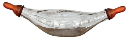
Victorian baby bottle

An artefact is an object from the past. Museums often display historical artefacts. Artefacts can tell us about how people used to live. Everyday objects like baby bottles, clothing, toys and books can tell us about childhood in the past.