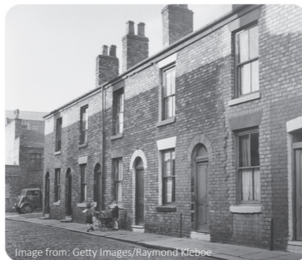
A street in the 1950s.

The way people use land changes over time. For example, in the 1950s there were fewer cars, so fewer roads were needed. Today lots of people have cars, so there are many more roads for people to drive on and driveways for parking.