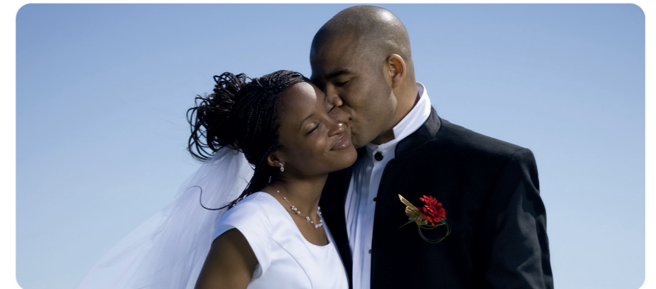
Weddings happen when two adults get married.