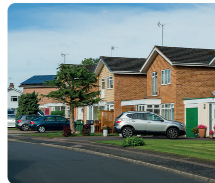
A street today.