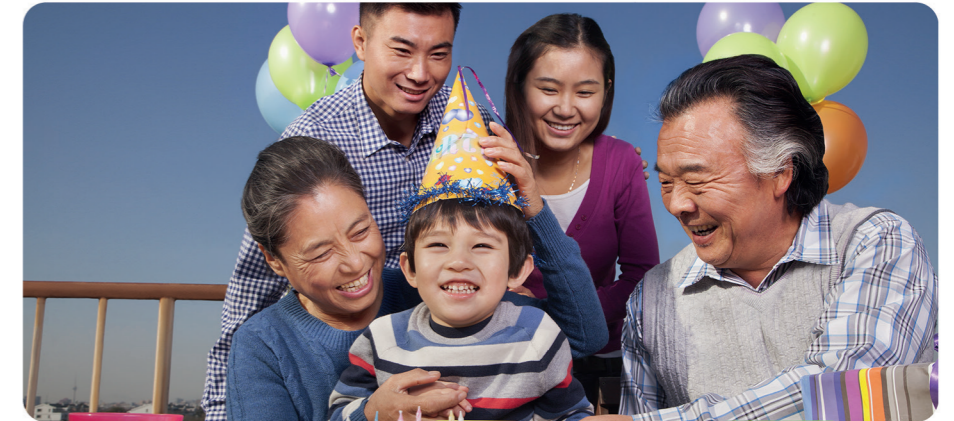
Birthdays happen every year.

Important life events include birthdays, religious festivals or family celebrations. Some life events happen every year and some happen at certain stages of human life.