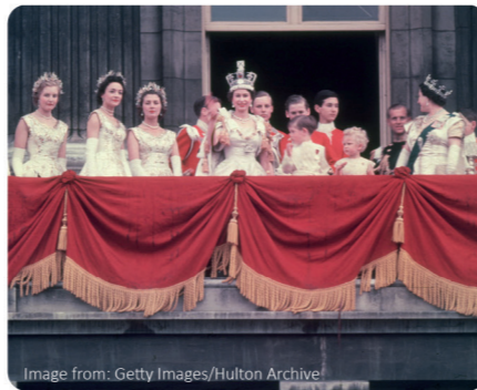
Queen Elizabeth II on her coronation.

A coronation is a ceremony where the crown is placed on the head of the new king or queen. Elizabeth II was the Queen of the United Kingdom for 70 years until she died in 2022. The coronation ceremony of Elizabeth II took place on 2nd June 1953 at Westminster Abbey, London. Many people celebrated the coronation by holding street parties.