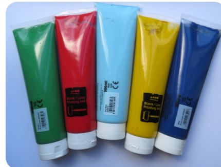
coloured printing inks